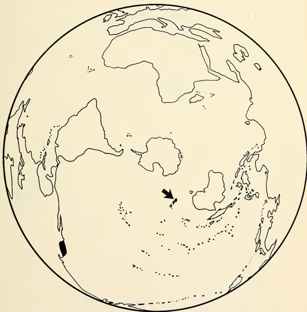
Fig. 3. Distribution of the living members of the family Ascaphidae; Ascaphus in the northwestern United States and Leiopelma in New Zealand.

The modern families of frogs are divisible into four primitive